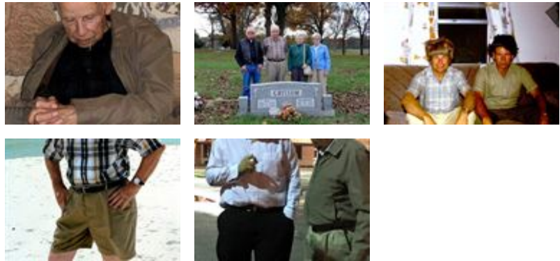
Bryan Funeral Home - August 22, 2019 at 04:53 PM

“ 11 files added to the album Life Tributes